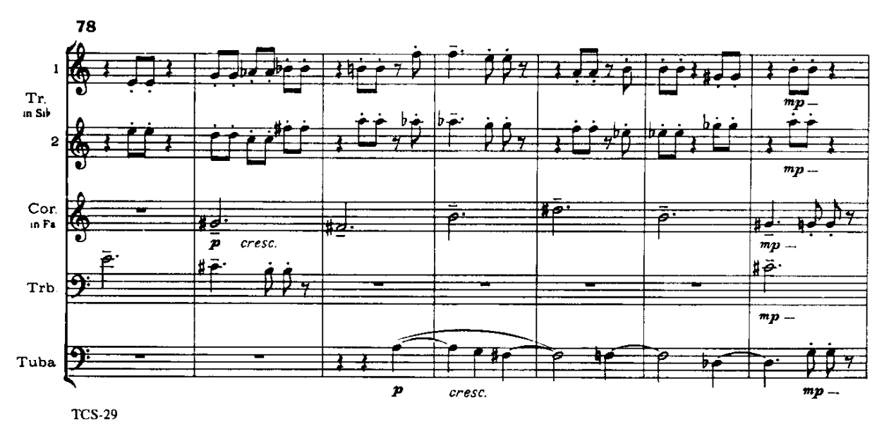
(© 1983 THOMAS C. STANGLAND CO. • All Rights Reserved • PRINT or DOWNLOAD for study purposes only)