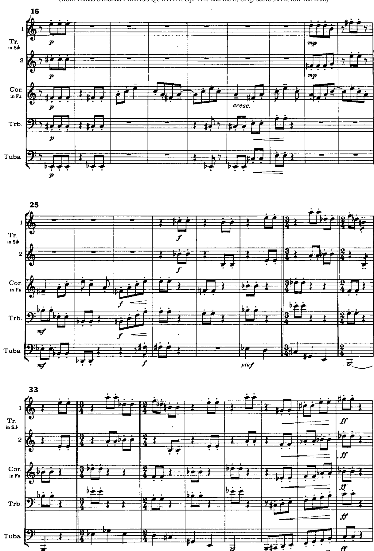
( @ 1983\ THOMAS\ C.\ STANGLAND\ CO.\ \bullet\ All\ Rights\ Reserved\ \bullet\ PRINT\ or\ DOWNLOAD\ for\ study\ purposes\ only)