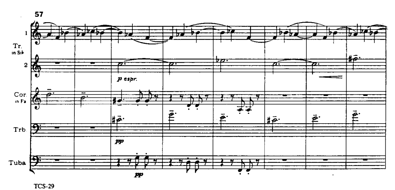
(@\ 1983\ THOMAS\ C.\ STANGLAND\ CO.\ \bullet\ All\ Rights\ Reserved\ \bullet\ PRINT\ or\ DOWNLOAD\ for\ study\ purposes\ only)