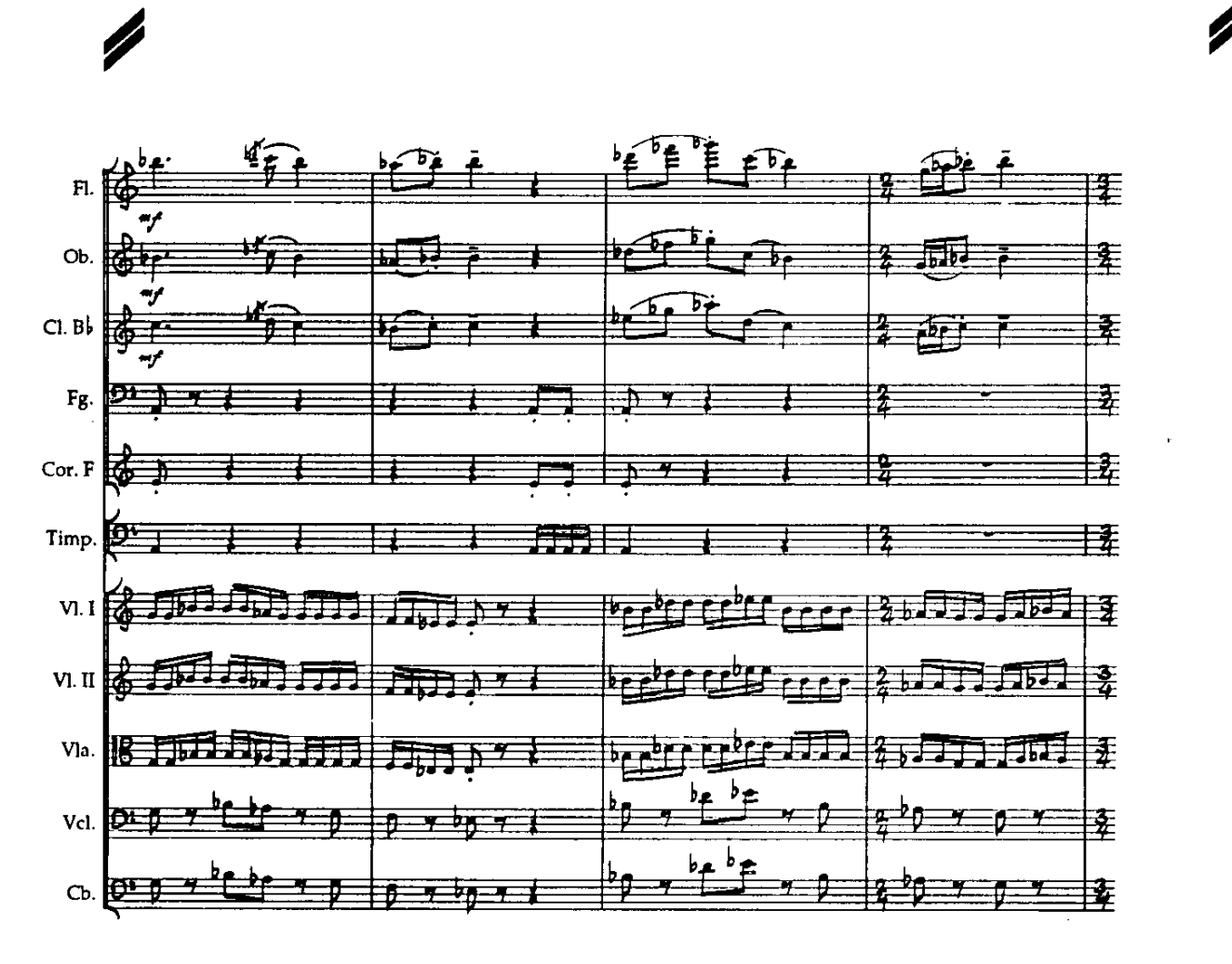
TCS - 49 (© 1976, 1986 THOMAS C. STANGLAND CO. • All Rights Reserved • PRINT or DOWNLOAD for study purposes only)