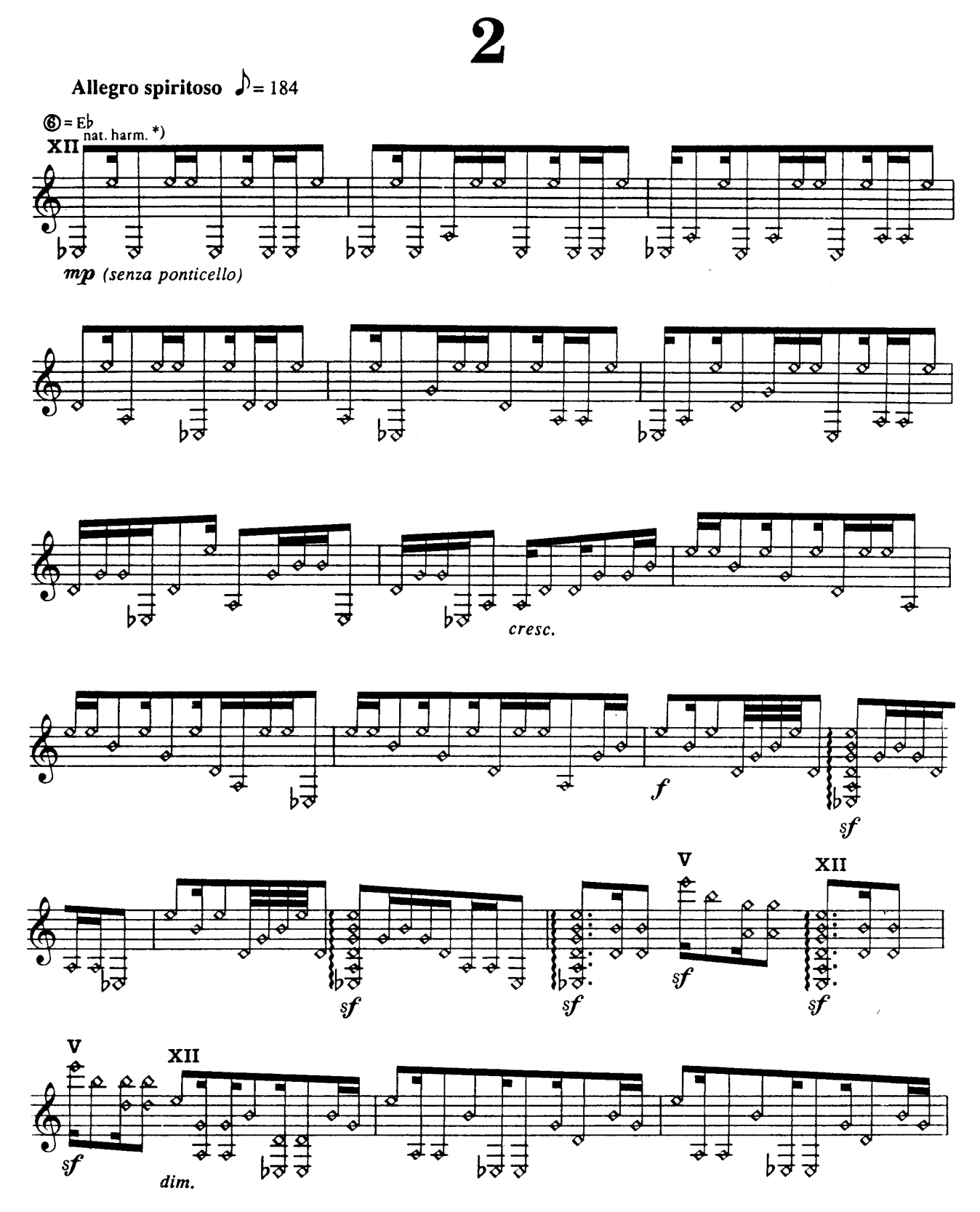
*) Harmonics sound an octave higher than written. Roman numerals indicate at what fret, or fret fraction (II ½, I ¾), the harmonic is to be played.